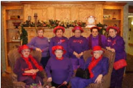
The Red Hats together at Grandview’s Appreciation Supper